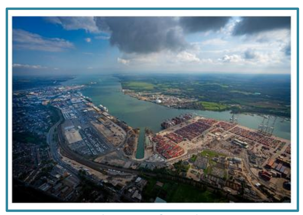
Southampton Water, © ABP Southampton

Source: Solent Forum Members' Survey 2024