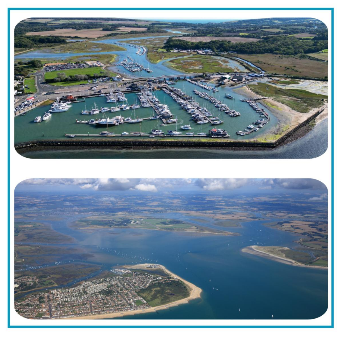
Top: Yarmouth. Bottom: Chichester Harbour

Full details of the business planning process can be found on the <u>business plan section of the</u> <u>Forum's website</u>.