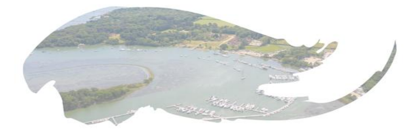
Beaulieu River

Horizon Scanning has highlighted that the Government's 25 Year Environment Plan will continue to shape national coastal and marine policy, and that the review of the Environmental Improvement Plan will deliver ambitious targets to save nature, including those on water, circular economy and air quality as well as delivering against the target to halt the decline in species abundance by 2030.