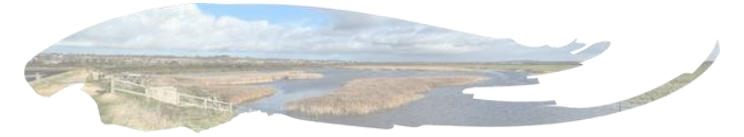
Titchfield Haven

Guiding principles for the Forum's involvement in external projects have also been set out in this Plan. Project involvement will be reviewed annually against the staff resource available and updates will be published in the Annual Reports.