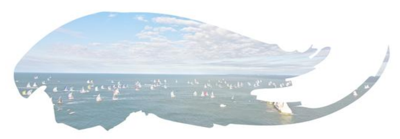
Round the Island Race

A large scale partnership project is proposed across the Solent that has been identified as a need by Solent Forum members. The Solent Forum agrees to project manage and charges a twenty percent management fee. Additional staff time is charged for deliverables and events that are outside of core project management.